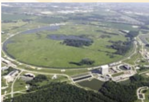
Fermilab's Tevatron collider has tripled its luminosity since 2003.

Totaling up luminosity gets a little tricky because of the units, which use the concept of a "barn," an area of 10^{-24} \text{ cm}^2 , based on the typical nucleus cross section. Picobarns are 10^{-12} barns, and femtobarns are 10^{-15} barns. Luminosity is rated in collisions per cross sectional area so luminosities measured in inverse picobarns (collisions per 10^{-36} \text{ cm}^2 ) are not as